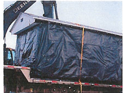
Cleanup of Snow Property