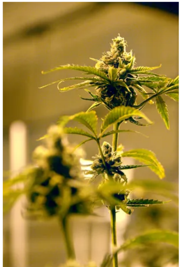
A flowering marijuana plant at the Native Nations Cannabis facilities on the Flandreau Santee Sioux Tribe reservation.