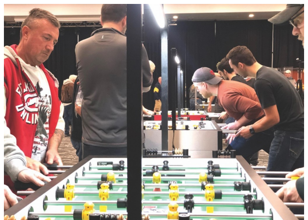
More than 100 table hockey or foosball players, from locals to national professional competitors, took to the floor at Royal River Casino and Hotel Feb. 18-19 for a state tournament.