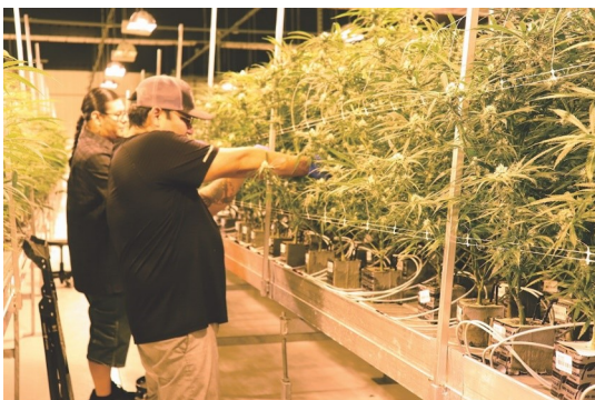
This Enterprise file photo shows the growing of the marijuana plants for the Santee Sioux Tribe’s medical marijuana program.

“We’re not watching everyone that’s coming in and out of there trying to find a way to stop them,” said Weber. “But through the course of our job, if we find an infraction and stop someone and there’s weed in their car and they have a medical marijuana card and they’re not tribal, then we address it.”