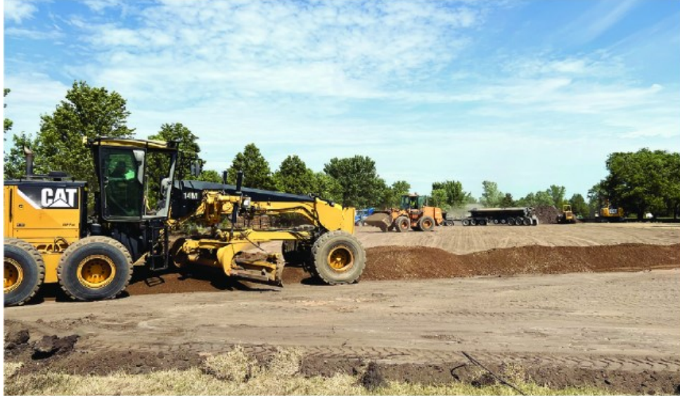
Dirt work has begun on the Flandreau Development Corporation's lot just east of Tractor Supply in Flandreau.

Commercial lots are being developed in both Flandreau and Colman to make way for new businesses.