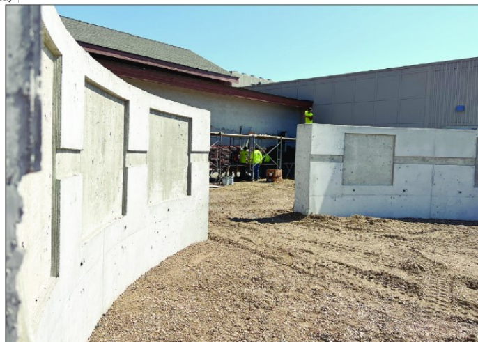
Just outside of the main entrance, a Veterans Memorial with a gas fireplace at the center is being constructed. The memorial includes a circle of 5-foot tall walls. Each will include memorial data that includes the names of all of those who have defended the tribe dating as far back as 1892.