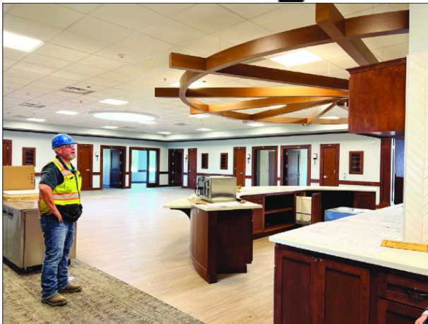
The new Flandreau Santee Sioux 'Living Center' is approximately 55,000 sq. ft. with a total of 42 rooms designed to care for those that are aging or in need of assistance and rehabilitation after illness or an injury. Fourteen of the rooms, the south wing, will be dedicated to memory care (Alzheimer's etc.). The project broke Ground on November 4th, 2020 and took nearly two years to complete. Ultimately, even with the challenges of getting materials and COVID restrictions, tribal leaders say that the project came in under budget and ahead of schedule.